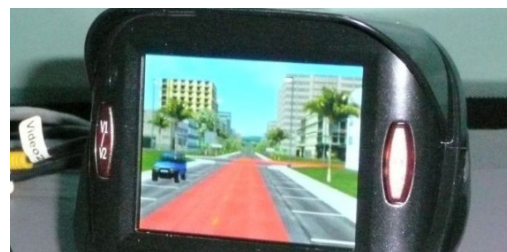
Figure 4. LCD screen displaying SV PND.

2. Street View PND (SV PND) : The egocentric street view PND utilizes the LCD to display a sequence of images of the world from the driver's perspective. This sequence is augmented with a translucent navigation route (Figure 4). The navigation route was displayed using a wide, transparent, road level surface, as shown in Figure 4. We used this road-level surface because of its similarity to commercially available HDD-based PNDs (e.g. [3]). Simulating the SV PND required having a stream of images of the surrounding environment. This stream was generated by a driving simulator running in parallel with the one that was operated by our participants. An SV PND uses images of the world taken at some earlier point in time, and this was faithfully represented in our experiment. Specifically, fixed entities (roads, buildings, etc.) were the same in both simulations, while parked and moving vehicles and