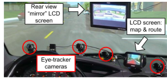
Figure 2. Experimental setup inside the vehicle.