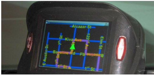
Figure 5. LCD screen displaying SPND.

pedestrians were different. The SV PND displayed a new image every 15 meters, which is the distance at which images are also taken for Google Street View [4] in a city environment. Thus, participants experienced an SV PND similar to Google Maps Navigation, which uses Google Street View data. Note that the season, the weather and the time of day were identical in our two simulations. In real-life scenarios, these variables can be quite different between the outside world and Google Street View data.