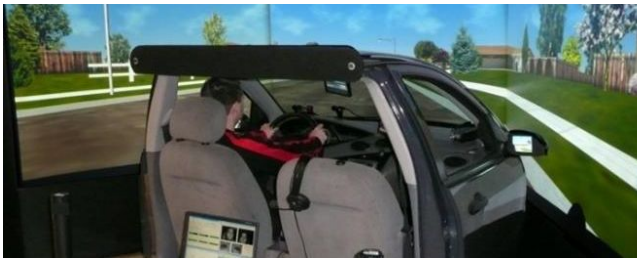
Figure 1. 180° field of view driving simulator.

drivers, their approach reduces the effect of divided attention and improves driving in comparison to standard PNDs.