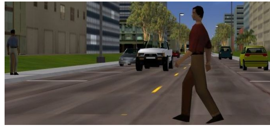
Figure 6. Simulated two-lane city road. The environment included ambient traffic and unexpected events, such as this pedestrian emerging from behind a parked vehicle.

As shown in Figure 6, subjects drove on two lane city roads which included ambient vehicles, moving pedestrians, traffic signs and lane markings. Lanes were 3.6 meters wide. Subjects were instructed to drive as they normally would in real life and to obey all traffic laws. They were also instructed (and trained) to pay attention to unexpected