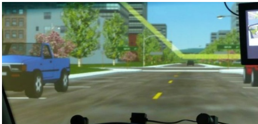
Figure 3. AR PND from the driver's perspective.

The experiment was performed in a high-fidelity driving simulator (Figure 1) with a 180° field of view screen and a full-width automobile cab. The cab sits on top of a motion base which simulates car movements for braking and accelerating as well as bumps on the road. As shown in Figure 2, the simulator was equipped with two eye-trackers which track subjects' gaze and head position using two pairs of cameras mounted on the dashboard. Figure 2 also shows the location of the in-car LCD screen which was used as the display for the standard PND and the SV PND. The LCD screen was placed on top of the dashboard, which is a common place for contemporary PNDs and smart phones with navigation capabilities. The size of the LCD screen was 3.5 inches (about 9 cm) diagonally which falls within the typical size of commercially available navigation devices.